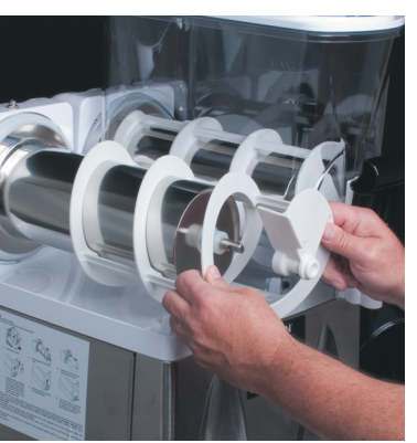
4.Pull the auger from the cooling drum.