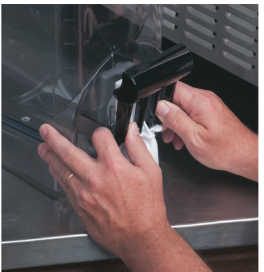
6. CAUTION: Faucet valve is under 7. Carefully slide valve up to remove 8. Remove the auger nose bushing 9. Remove the drip tray and cover. spring tension. Spread one side of spring and faucet seal. Extra care from inside the front of the hopper. the handle first, then the other and should be taken when handling the NOTE: Do not scratch this surface disconnect from hopper.