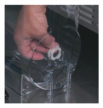
inside the front of the hopper.