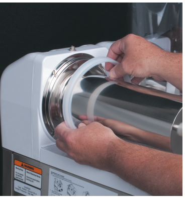
5. Remove the hopper seal from the flange on the cooling drum.