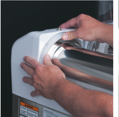
1. Replace the auger nose bushing 2. Install the hopper seal over the 3. Align the auger shafts with the 4. Install the hopper over the auger 6. Set the hopper lid on the hopper flange at the rear of the cooling drum augers. Push the augers as far as and cooling drum and slide it into with lamp cord at the back. as shown.