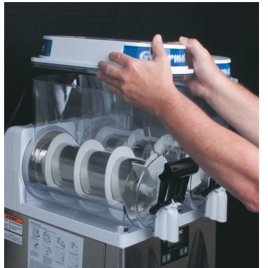
1. Unplug the hopper lamp cord(s) 2. Depress the hopper lock plunger, 3. Pull the hopper assembly forward and remove the hopper lid(s). lift slightly. NOTE: On Autofill models, remove the level probe and fill tubes from the hopper.

Turn cooling to OFF selection. Empty all product from the hopper(s). Turn auger to OFF selection.