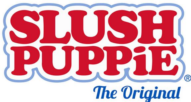
"The Original" Stacked Logo